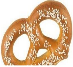
Giant Pretzel 8

Herzlich Willkommen to The Village Corner Oktoberfest